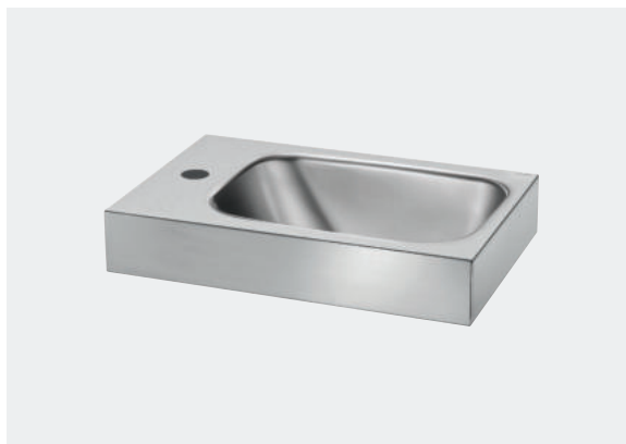
LAVANDO WC hand washbasin Ref. DELABIE: 121360

Images available on our website delabie.com , in the PRESS section